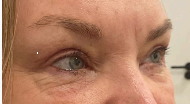
BLEPHAROPLASTY BEFORE AND AFTER - ONE MONTH APART